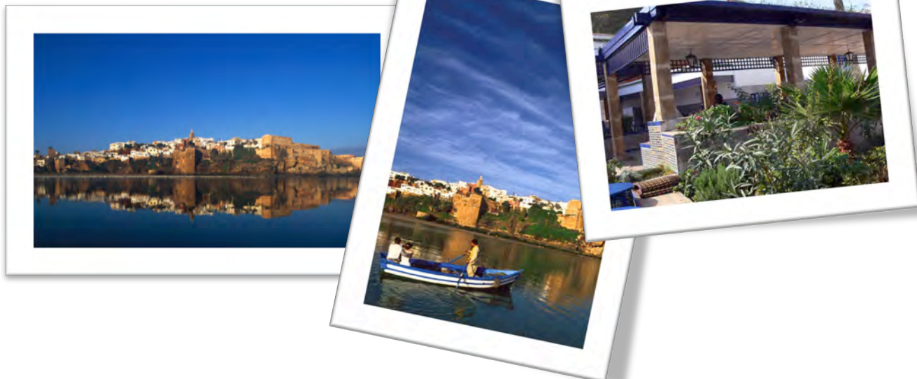
Vues du Bouregreg sur les Oudayas Le café des Maures